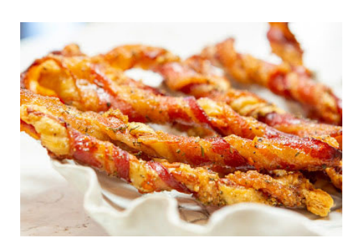
Makes: 26 servings Active Time: 30 minutes Bake Time: 30-50 minutes Total Time: 1 hour 50 minutes